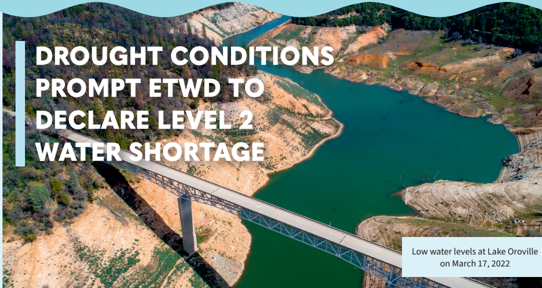
Low water levels at Lake Oroville on March 17, 2022

There's no relief in sight for California's current drought, and there's not a drop of water to waste. State officials are warning residents to brace for a third year of dry conditions and have cut back the amount of water the region receives from the State Water Project from 15% to only 5% of the normal annual allocation leading to a significant draw on critical water storage reserves.