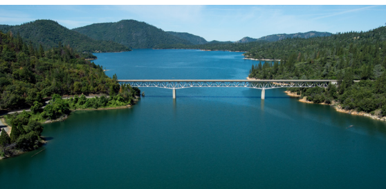
Water levels at Lake Oroville dropped from 96% of total capacity on May 11, 2016 (above) to extremely low levels on July 26, 2021 (below).

Free, educational water management event for HOA board members, community managers and professional landscapers. Learn more, and register at etwd.com/conservation/h2o-for-hoas .