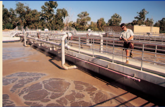
Construction of the new aeration basins

The funds collected through the Standby Fee (which total $900,000 annually) enabled the District to completely reconstruct the 30 year-old wastewater treatment facilities in the mid-1990s.