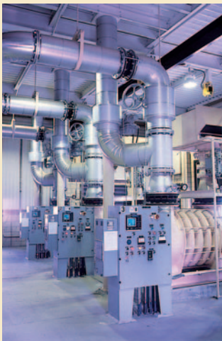
New state of the art aeration blowers

The District is pleased to report that sufficient funds have now been collected to pay-off the zero interest state loan that funded the project, and the Standby Fee will be discontinued.