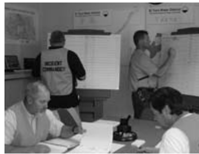
ETWD Emergency Operations Center (EOC)

The El Toro Water District is dedicated to ensuring high quality reliable service to its customers and to safeguarding those services when disaster strikes. The District's long history of emergency preparation and response planning has recently been enhanced through participation in the development of the Orange County Regional Water and Wastewater Multi-Hazard Mitigation Plan.