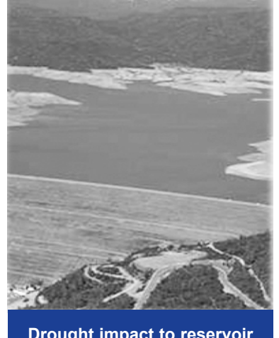
Drought impact to reservoir storage.

forced El Toro Water District to mandate water conservation and to implement a Water Allocation Program.